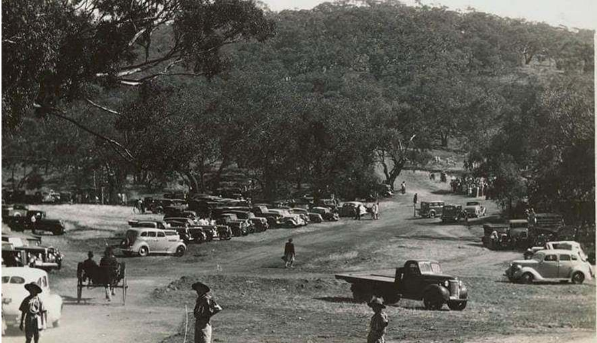
Boy scouts checking passes at Mt Tarrengower Hillclimb in the 1940's