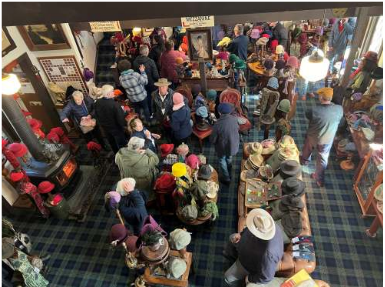
Gordon Hat and Boot Shoppe