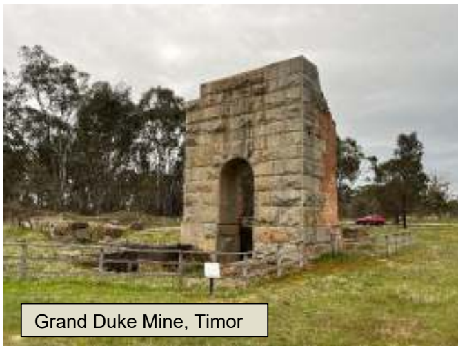
Grand Duke Mine, Timor

including quite a few from interstate, had participated in previous Golden Oldies, but to the half dozen “newbies” like myself, I can only describe it as being similar to a VDC “Spirit of the Twenties”. We all had a wonderful time, the small country towns we visited benefited from an economic boost and we raised a reasonable amount for Peter Mac Cancer Foundation so a definite Win-Win all round!